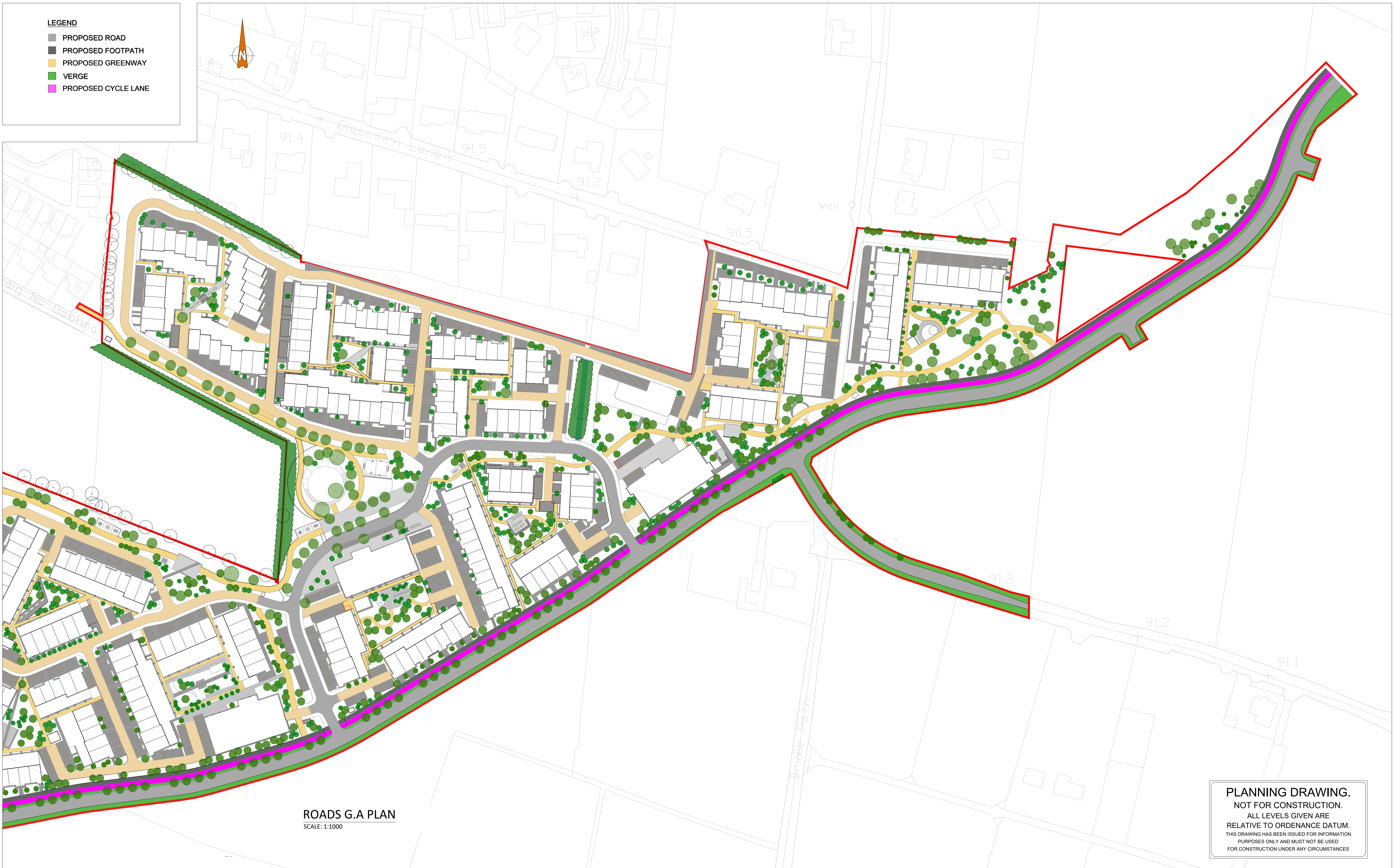
ROADS G.A PLAN SCALE: 1:1000

PLANNING DRAWING. NOT FOR CONSTRUCTION. ALL LEVELS GIVEN ARE RELATIVE TO ORDENANCE DATUM. THIS DRAWING HAS BEEN ISSUED FOR INFORMATION PURPOSES ONLY AND MUST NOT BE USED FOR CONSTRUCTION UNDER ANY CIRCUMSTANCES